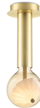
TLC7045-21BS ceiling lamp(bulb not incl.)

E27, Max. LED 10W ø12 cm †125 cm ♀ bulb not incl.