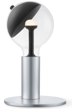
50030 side grey(bulb not incl.)

☰ E27, Max. LED 10W ø17 cm ‡9 cm ♀ bulb not incl. ⊕ switch included, cable length 150 cm