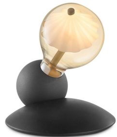
TLT7044-01SB table lamp(bulb not incl.)

E27, Max. LED 10W ø13 cm †20 cm ♀ bulb not incl. ⊕ switch included, cable length 150 cm