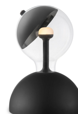
60020 bumb black(bulb not incl.)

☰ E27, Max. LED 10W ⌀17 cm ‡9 cm ♀ bulb not incl. ⊕ switch included, cable length 150 cm