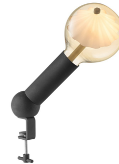
TLT7044-24SB table lamp(bulb not incl.)

E27, Max. LED 10W ø9 cm †20 cm ♀ bulb not incl.