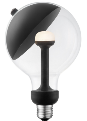
0672-05-D umbrella black G120 reflector

E27 2700K 5.5W=40W | 450 lm 25.000 hours CRI 90 ø12 cm ↓ 18.6 cm