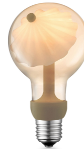
0673-01-N umbrella amber G80 reflector