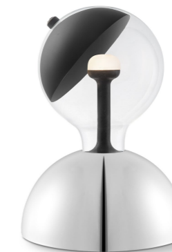
60040 bumb chrome(bulb not incl.)

☰ E27, Max. LED 10W ⌀17 cm ‡9 cm ♀ bulb not incl. ⊕ switch included, cable length 150 cm