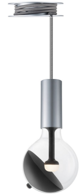
15030 pulley grey(bulb not incl.)

E27, Max. LED 10W ↔12 cm ↓154 cm ♀ bulb not incl. ♂ cable length 150 cm