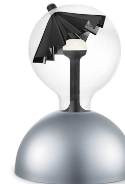
60030 bumb grey(bulb not incl.)

☰ E27, Max. LED 10W ⌀17 cm ‡9 cm ♀ bulb not incl. ⊕ switch included, cable length 150 cm