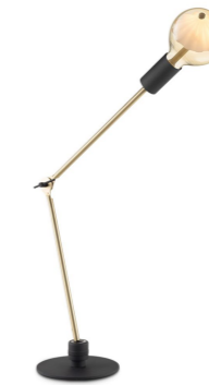
TLT7046-01BS table lamp (bulb not incl.)

☰ E27, Max. LED 10W ⌀28 cm †+70 cm ♀ bulb not incl.