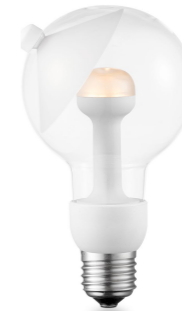
0371-01-N umbrella white G80 reflector

E27 3W=25W | 250 lm CRI 90 2700K 25.000 hours ø8 cm | 13.7 cm