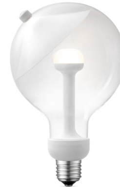
0671-01-D umbrella white G120 reflector