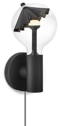
30020 wally black(bulb not incl.)

☰ E27, Max. LED 10W ↔12 cm ↓10.4 cm ♀ bulb not incl. ⊕ switch included, cable length 200 cm