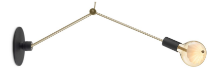
TLW7046-01BS wall lamp (bulb not incl.)

☰ E27, Max. LED 10W ⌀28 cm †70 cm ♀ bulb not incl.