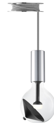
15040 pulley chrome(bulb not incl.)

E27, Max. LED 10W ↔12 cm ↓154 cm ♀ bulb not incl. ♂ cable length 150 cm