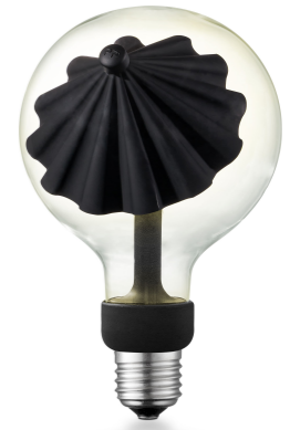
0673-03-D umbrella black G120 reflector