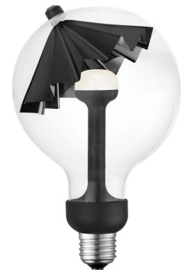
0670-07-D umbrella black G120 reflector