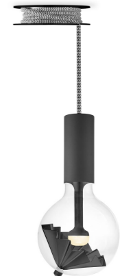
15020 pulley black(bulb not incl.)

E27, Max. LED 10W ↔12 cm ↓154 cm ♀ bulb not incl. ♂ cable length 150 cm