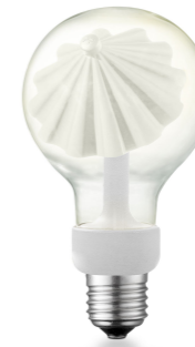
0673-02-N umbrella white G80 reflector