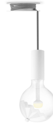
15010 pulley white(bulb not incl.)

E27, Max. LED 10W ↔12 cm ↓154 cm ♀ bulb not incl. ♂ cable length 150 cm