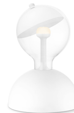
60010 bumb white(bulb not incl.)

☰ E27, Max. LED 10W ⌀17 cm ‡9 cm ♀ bulb not incl. ⊕ switch included, cable length 150 cm