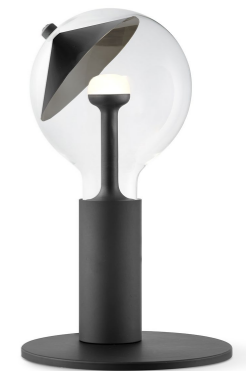
50020 side black(bulb not incl.)

☰ E27, Max. LED 10W ø17 cm ‡9 cm ♀ bulb not incl. ⊕ switch included, cable length 150 cm