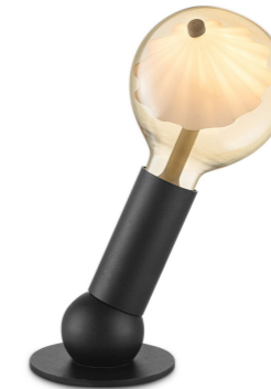
TLT7044-20SB table lamp(bulb not incl.)

E27, Max. LED 10W ø7 cm †24 cm ♀ bulb not incl. ⊕ switch included, cable length 150 cm