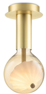
TLC7045-14BS ceiling lamp(bulb not incl.)

E27, Max. LED 10W ø12 cm †21 cm ♀ bulb not incl.