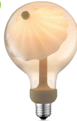
0673-01-D umbrella amber G120 reflector