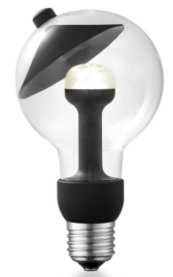
0371-05-N umbrella black G80 reflector

E27 3W=25W | 250 lm CRI 90 2700K 25.000 hours ø8 cm | 13.7 cm