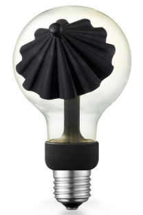
0673-03-N umbrella black G80 reflector