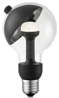
0372-05-N umbrella black G80 reflector

E27 3W=25W | 250 lm CRI 90 2700K 25.000 hours ø8 cm | 13.7 cm