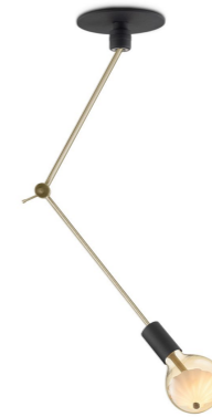
TLC7046-01BS ceiling lamp (bulb not incl.)

☰ E27, Max. LED 10W ⌀28 cm †70 cm ♀ bulb not incl.