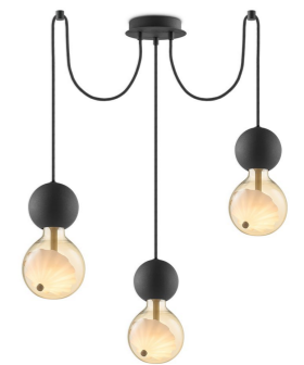
TLP7044-03SB pendant lamp(bulb not incl.)

☑ E27, Max. LED 10W ⌀12 cm †114 cm ♀ bulb not incl.