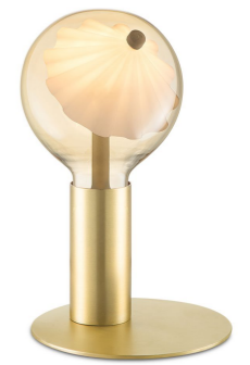
TL7045-11BS table lamp(bulb not incl.)

☑ E27, Max. LED 10W ⌀15 cm †30 cm ☑ bulb not incl. ⊕ switch included, cable length 150 cm