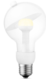
0372-01-N umbrella white G80 reflector

E27 3W=25W | 250 lm CRI 90 2700K 25.000 hours ø8 cm | 13.7 cm