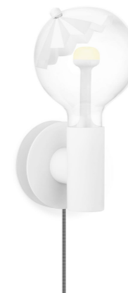
30010 wally white(bulb not incl.)

☰ E27, Max. LED 10W ↔12 cm ↓10.4 cm ♀ bulb not incl. ⊕ switch included, cable length 200 cm