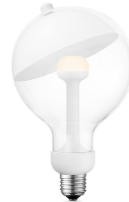
0672-01-D umbrella white G120 reflector

E27 2700K 5.5W=40W | 450 lm 25.000 hours CRI 90 ø12 cm ↓ 18.6 cm