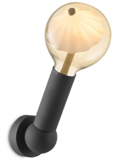
TLW7044-20SB wall lamp(bulb not incl.)

E27, Max. LED 10W ø9 cm †20 cm ♀ bulb not incl.