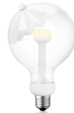
0670-06-D umbrella white G120 reflector