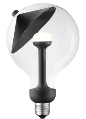
0671-05-D umbrella black G120 reflector