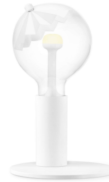
50010 side white(bulb not incl.)

☰ E27, Max. LED 10W ø17 cm ‡9 cm ♀ bulb not incl. ⊕ switch included, cable length 150 cm