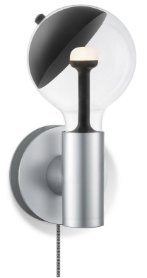
30030 wally grey(bulb not incl.)

☰ E27, Max. LED 10W ↔12 cm ↓10.4 cm ♀ bulb not incl. ⊕ switch included, cable length 200 cm