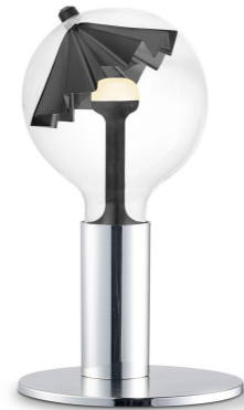
50040 side chrome(bulb not incl.)

☰ E27, Max. LED 10W ø17 cm ‡9 cm ♀ bulb not incl. ⊕ switch included, cable length 150 cm